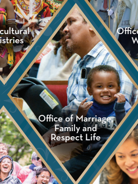
Office of Marriage, Family and Respect Life