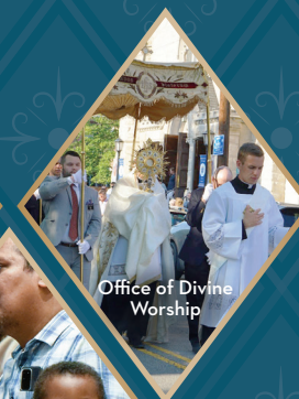
Office of Divine Worship