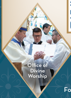
Office of Divine Worship