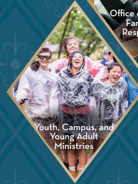
Youth, Campus, and Young Adult Ministries