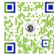
Faith Direct for eGiving

Our Lady of Lourdes accepts online donations via Faith Direct! You can donate to all our parish's first and second collections and set up recurring payments on your own schedule. To sign up, scan the QR code or on the cover of this bulletin, or visit www.faithdirect.net and enter parish code VA327 .