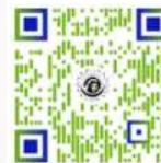
Faith Direct for eGiving

Our Lady of Lourdes accepts online donations via Faith Direct! You can donate to all our parish's first and second collections and set up recurring payments on your own schedule. To sign up, scan the QR code or on the cover of this bulletin, or visit www.faithdirect.net and enter parish code VA327 .