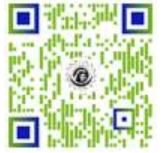
Faith Direct for eGiving

Our Lady of Lourdes accepts online donations via Faith Direct! You can donate to all our parish's first and second collections and set up recurring payments on your own schedule. To sign up, scan the QR code or on the cover of this bulletin, or visit www.faithdirect.net and enter parish code VA327 .