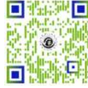
Faith Direct for eGiving