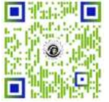
Faith Direct for eGiving

Our Lady of Lourdes accepts online donations via Faith Direct! You can donate to all our parish’s first and second collections and set up recurring payments on your own schedule. To sign up, scan the QR code or on the cover of this bulletin, or visit www.faithdirect.net and enter parish code VA327 .