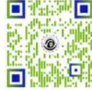
Faith Direct for eGiving