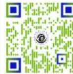
Faith Direct for eGiving

Our Lady of Lourdes accepts online donations via Faith Direct! You can donate to all our parish's first and second collections and set up recurring payments on your own schedule. To sign up, scan the QR code to the right or on the cover of this bulletin, or visit www.faithdirect.net and enter parish code VA327 .