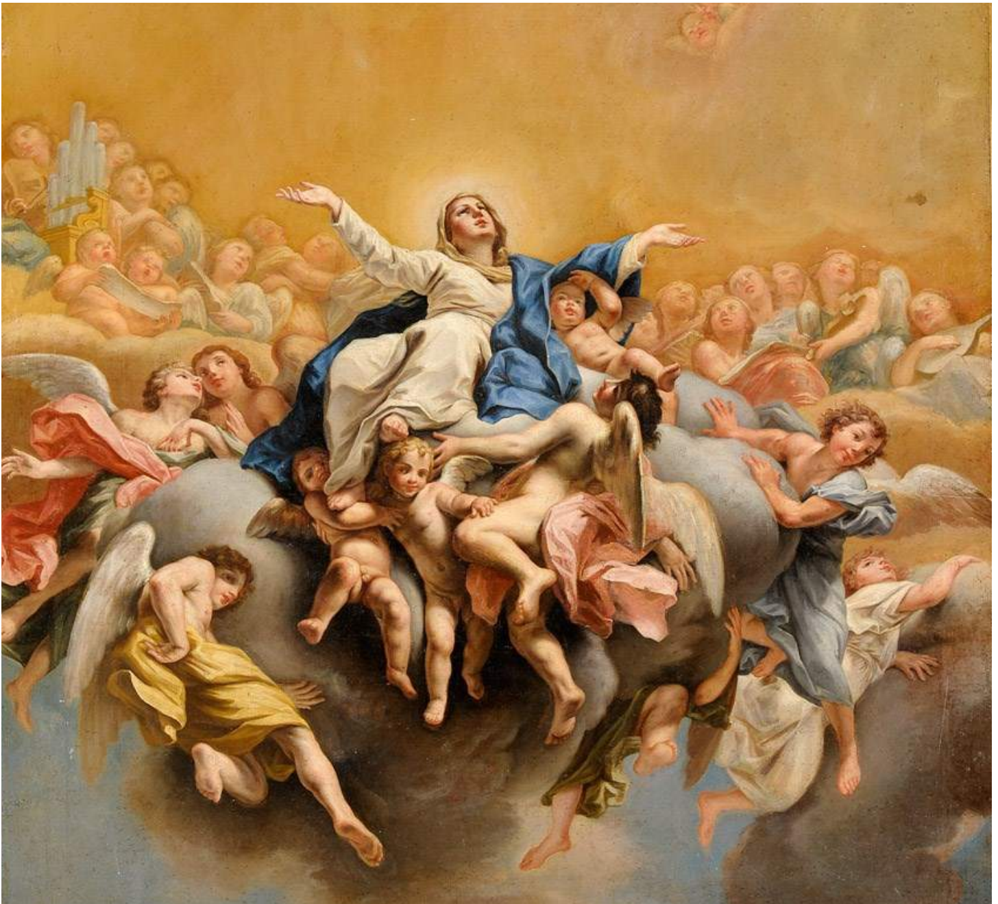
Mariano Salvador Maella (1739-1819), "The Assumption of the Blessed Virgin Mary"