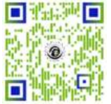
Faith Direct for eGiving

Our Lady of Lourdes accepts online donations via Faith Direct! You can donate to all our parish first and second collections and set up recurring payments on your own schedule. To sign up, scan the QR code to the right, or visit www.faithdirect.net and enter parish code VA327.