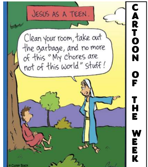
CARTOON OF THE WEEK

Help our church stay strong, safe and clean by donating to our parish Maintenance & Improvement Fund. Your donations keep our buildings comfortable, safe and ensure that our grounds and church look their best throughout the year.