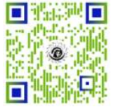
Faith Direct for eGiving

Our Lady of Lourdes accepts online donations via Faith Direct! You can donate to all our parish first and second collections and set up recurring payments on your own schedule. To sign up, scan the QR code to the right, or visit www.faithdirect.net and enter parish code VA327 .