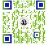
Faith Direct for eGiving

Our Lady of Lourdes accepts online donations via Faith Direct! You can donate to all our parish first and second collections and set up recurring payments on your own schedule. To sign up, scan the QR code to the right, or visit www.faithdirect.net and enter parish code VA327 .