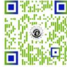
Faith Direct for eGiving