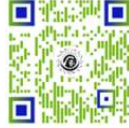
Faith Direct for eGiving