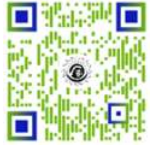
Faith Direct for eGiving

Our Lady of Lourdes accepts online donations via Faith Direct! You can donate to all our parish first and second collections and set up recurring payments on your own schedule. To sign up, scan the QR code to the right, or visit www.faithdirect.net and enter parish code VA327 .