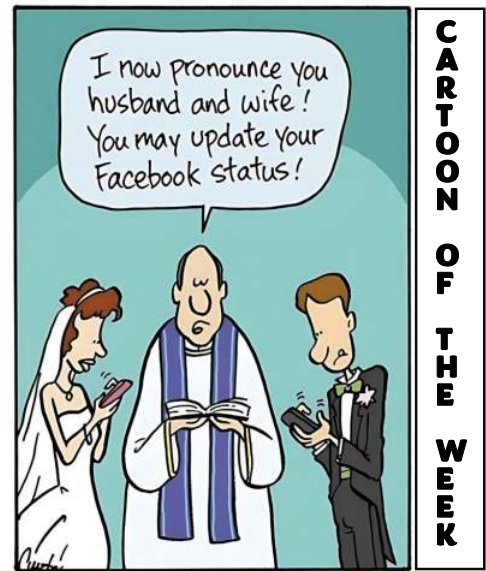
CARTOON OF THE WEEK

Help our church stay strong, safe and clean by donating to our parish Maintenance & Improvement Fund. Your donations keep our buildings comfortable, safe and ensure that our grounds and church look their best throughout the year.