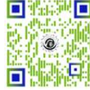
Faith Direct for eGiving