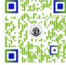
Faith Direct for eGiving