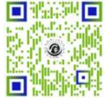
Faith Direct for eGiving

Our Lady of Lourdes accepts online donations via Faith Direct! You can donate to all our parish first and second collections and set up recurring payments on your own schedule. To sign up, scan the QR code to the right, or visit www.faithdirect.net and enter parish code VA327 .