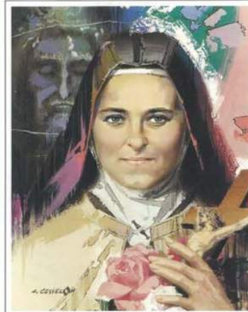
St. Thérèse of the Child Jesus and the Holy Face

Thérèse's spiritual doctrine is easily understood and can be practically applied in our very occupied, day-to-day lives. Her counsel can ably assist us in enduring and embracing difficulties in prayer, overcoming scruples, and patiently putting up with people who challenge us.