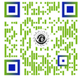
Faith Direct for eGiving

Our Lady of Lourdes accepts online donations via Faith Direct! You can donate to all our parish first and second collections and set up recurring payments on your own schedule. To sign up, scan the QR code to the right, or visit www.faithdirect.net and enter parish code VA327 .