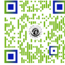
Faith Direct for eGiving