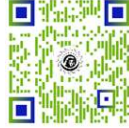
Faith Direct for eGiving