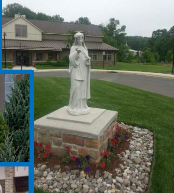
St. Rose of Lima Retirement Villa

Special Collection Next Weekend, June 10-11