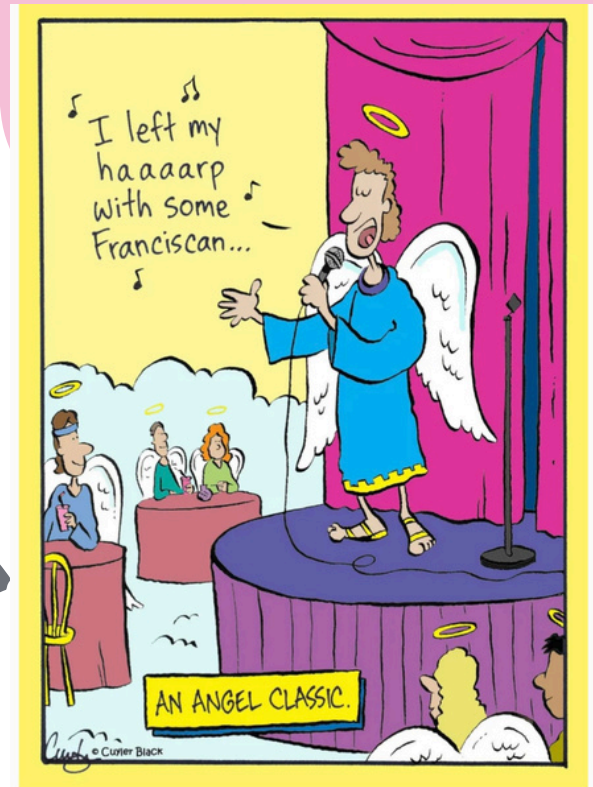
CARTOON OF THE WEEK