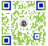
Faith Direct for eGiving

Our Lady of Lourdes accepts online donations via Faith Direct! You can donate to all our parish's first and second collections and set up recurring payments on your own schedule. To sign up, scan the QR code or on the cover of this bulletin, or visit