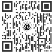
Make One-Time Donation

Help our church stay strong, safe and clean by donating to our parish Maintenance and Improvement Fund. Your donations keep our buildings comfortable, safe and ensure that our grounds and church look their best throughout the